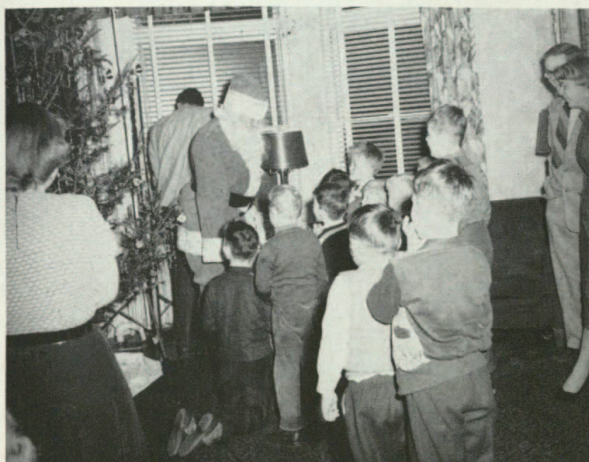
Santa and his crew...