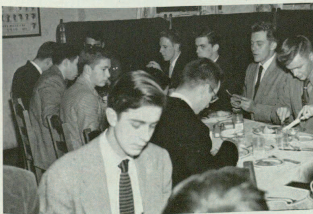
Dinner is more important than the photographer

Socially the year was very successful. Our annual pledge dance attracted some three hundred couples during the course of the evening. The customary Saturday night parties were kept lively by our home-style guitarist and pianist and by enthusiastic if not melodious brothers. The house received for the third straight year a subsidization from the I.F.C. for its always-successful old-clothes party, the Out-house Orgy. A new high in solidarity of spirit was shown at our departing president's bachelor party in February.