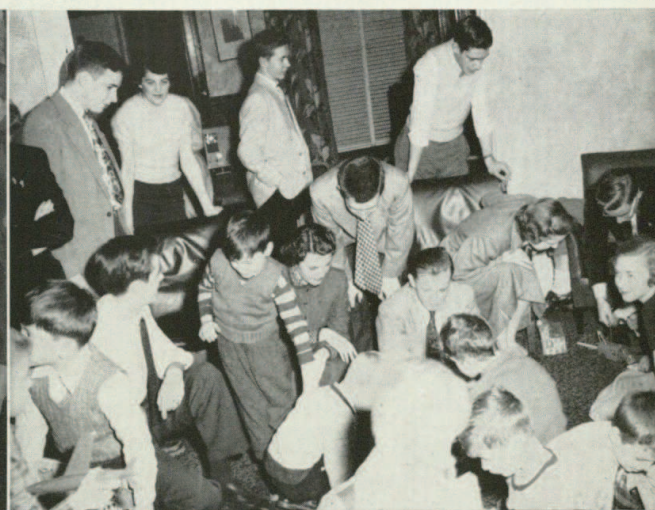
...at the annual Christmas Party

A policy discouraging impulsive expansion has been maintained by Theta Delta Chi since its founding in 1847, so that there are now twenty-nine charges. Theta Deuteron charge at Tech was established in 1890 and has occupied its present house at 314 Memorial Drive since 1930.