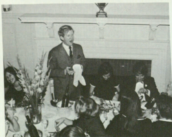
A toast to a special Theta Chi.